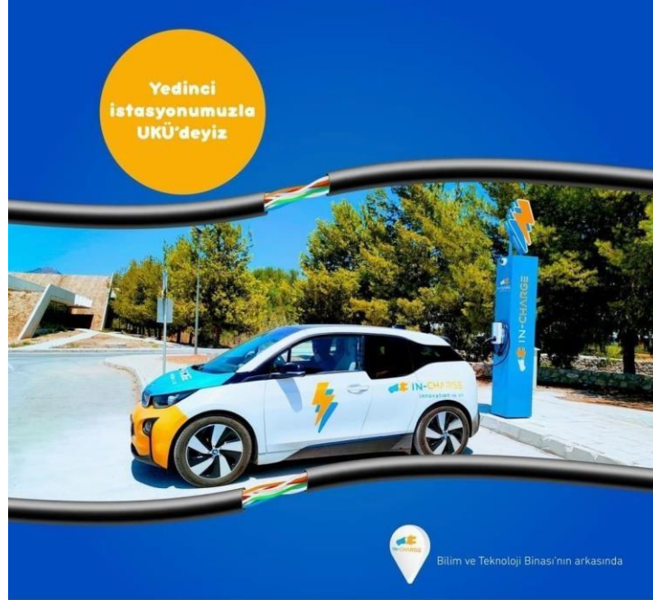
Electric car and its charging station in CIU

As the campus is located nearly 1.5 km away from the city center, a bicycle lane project between the city center and CIU campus is under discussion with Nicosia Turkish Municipality to provide the students/staff another opportunity to travel to the campus. The teams that travel around the campus, such as Project Technical Affairs and Campus Management, have electric bicycles available for them as they cover large distances in the university in one day. This increases the efficiency of how fast a problem can be addressed while also putting less strain on the staff and promoting physical health. This year, the number of bikes provided to the campus increased to 75 due to the increased staff of around 30 people in the teams who can utilise the bicycles.