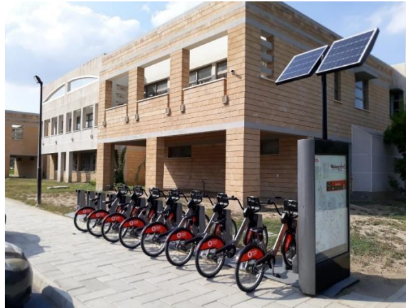
Campus Bicycle Racks