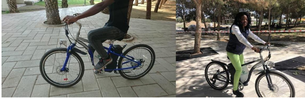
Campus Electrical Bikes