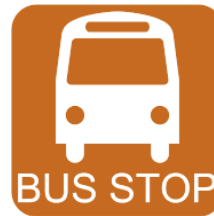
Three private bus services and free pickup services from ports