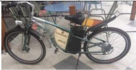
Free Electrical Bicycle