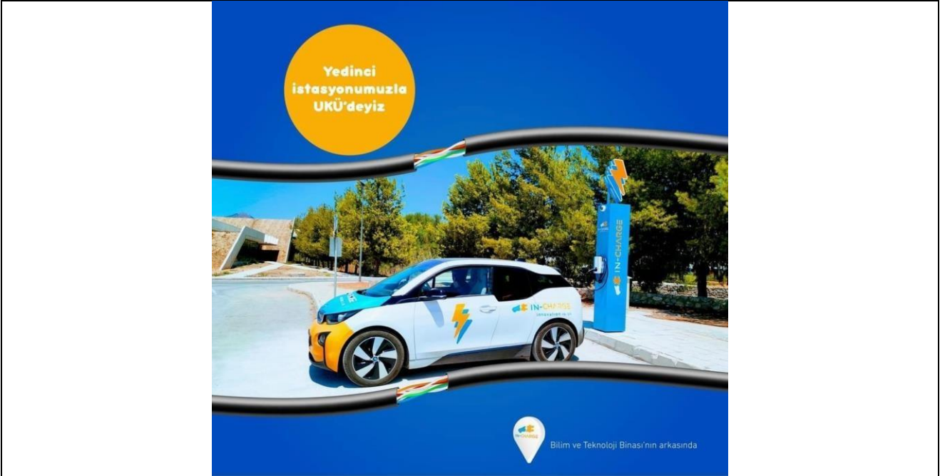
Electric car and its charging station in CIU

As the campus is located nearly 1.5 km from the city center, a bicycle lane project between the city center and CIU campus is being discussed with Nicosia Turkish Municipality to provide the students/staff another opportunity to travel to the campus. The teams that travel around the campus, such as Project Technical Affairs and Campus Management, have electric bicycles available for them as they cover large distances in the university in one day. This increases the efficiency of how fast a problem can be addressed while also putting less strain on the staff and promoting physical health. This year, the number of bikes provided to the campus increased to 75 due to the increased staff of around 30 people in the teams who can utilize the bicycles.