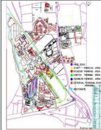
Limited parking area