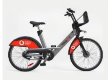
Bicycle for rent