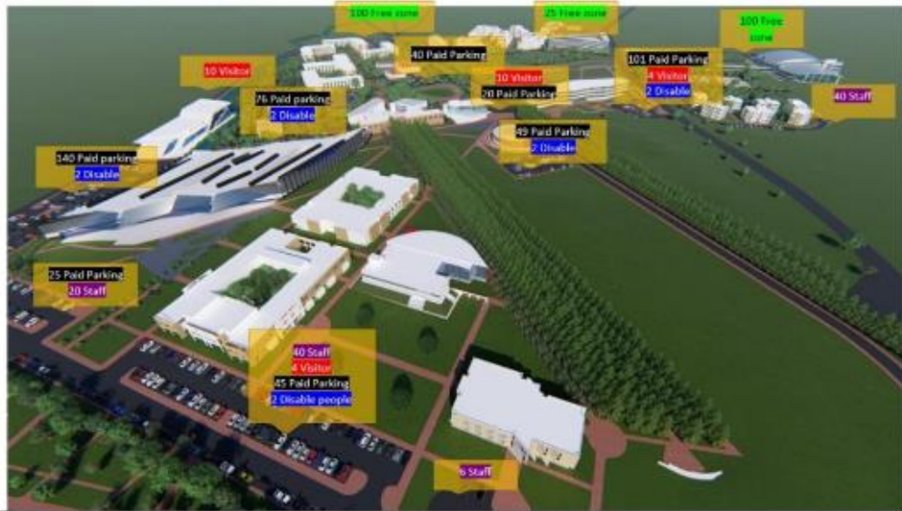
No. of Parking areas and categories