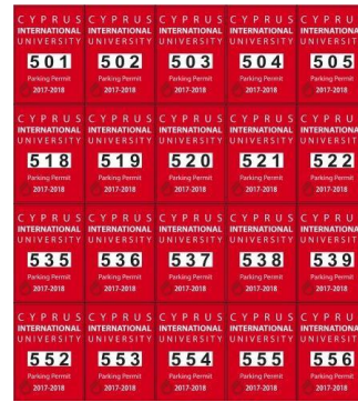
Parking permission stickers