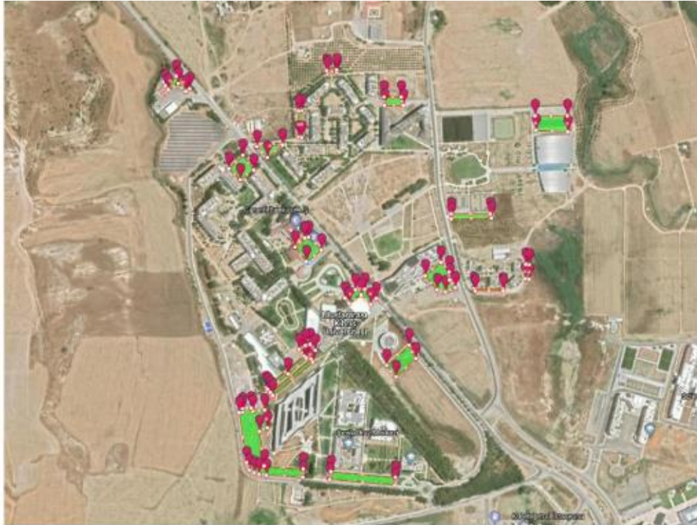
Parking Lots in the Campus