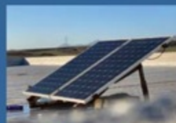
Figure 2. Solar Panel System.