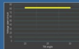
Table 1. The relationship of voltage with inclination angle.